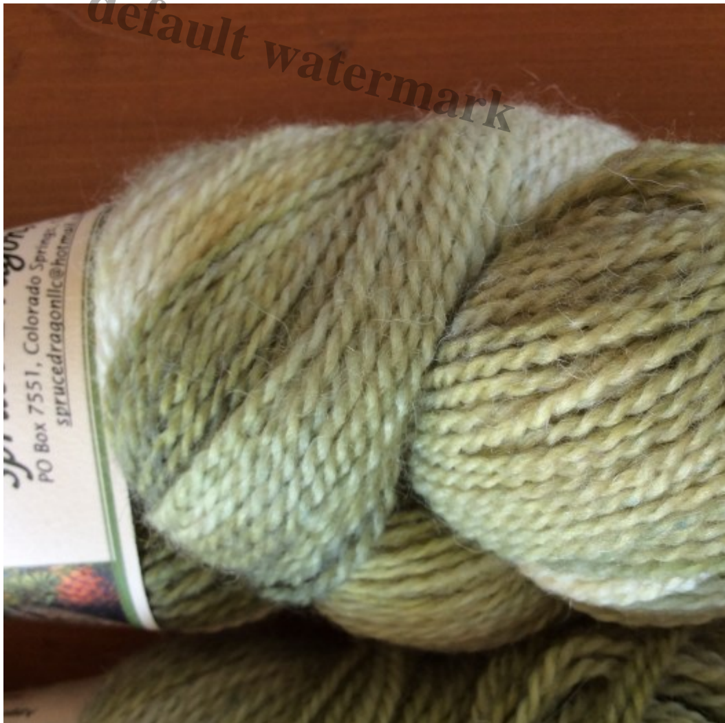
• Spruce Dragon yarn

One of my afore-mentioned WIPS is a shawl that I started in September of 2019 while on a trip with my BFFs from High School. It's a lovely shawl, with a fun pattern and oh-so-pretty yarn. Unfortunately, I got 2/3 of the way done and ran out of yarn (my math skills apparently failed me). Not a problem you think, just order some more. Well, not so easy. The yarn was a gift given to me by a friend, who discovered it at a craft market while on vacay in Colorado. I was able to track the dyer down but it had been too long and she wasn't able to help me out with another skein. Hmm, I thought, what to do? I thought about using a contrasting color, trying to fade it to a neutral, adding on to the beginning side using one or all of those ideas to make things more proportional, etc. I wasn't feeling the love with any of that. It has been bagged, tagged and stashed in a drawer ever since. Then, I said, "Self, why don't you try dyeing some more yarn in the same colors."•