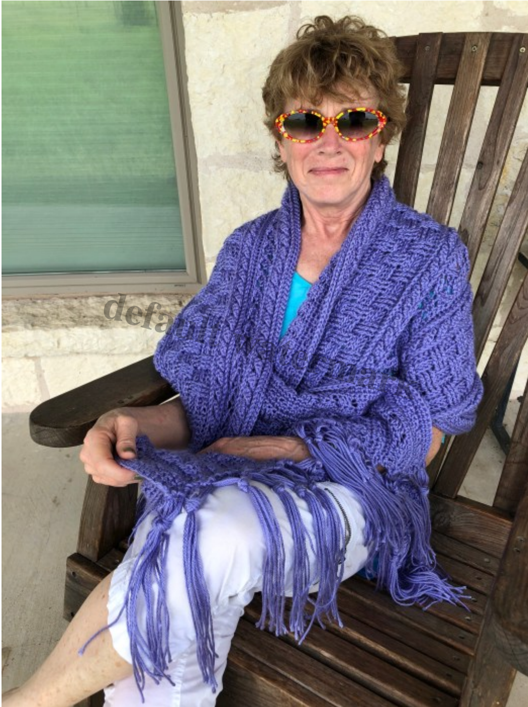
Gaithersburg Stole 6/20