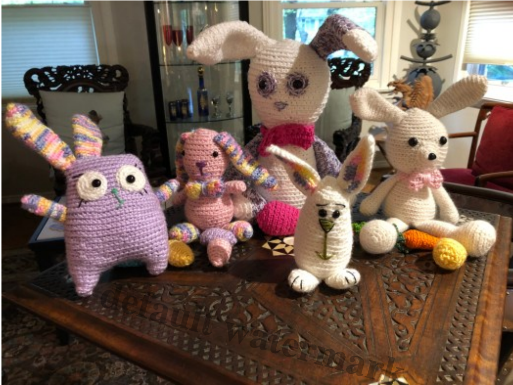
Easter Bunnies 3/20