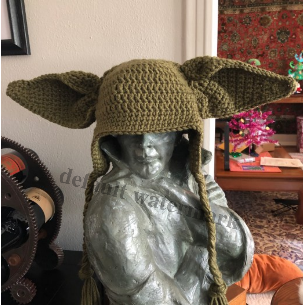
Baby Yoda 12/20