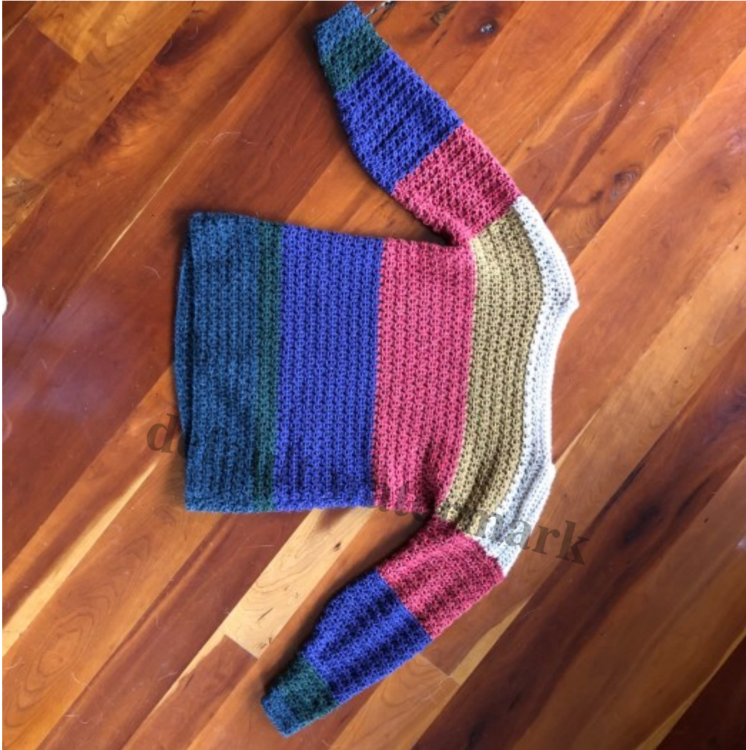
Fall Feels Sweater 1/20