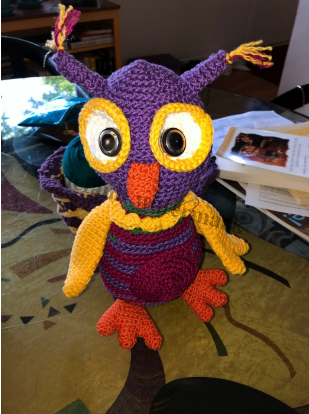
Oscar Owl 5/20