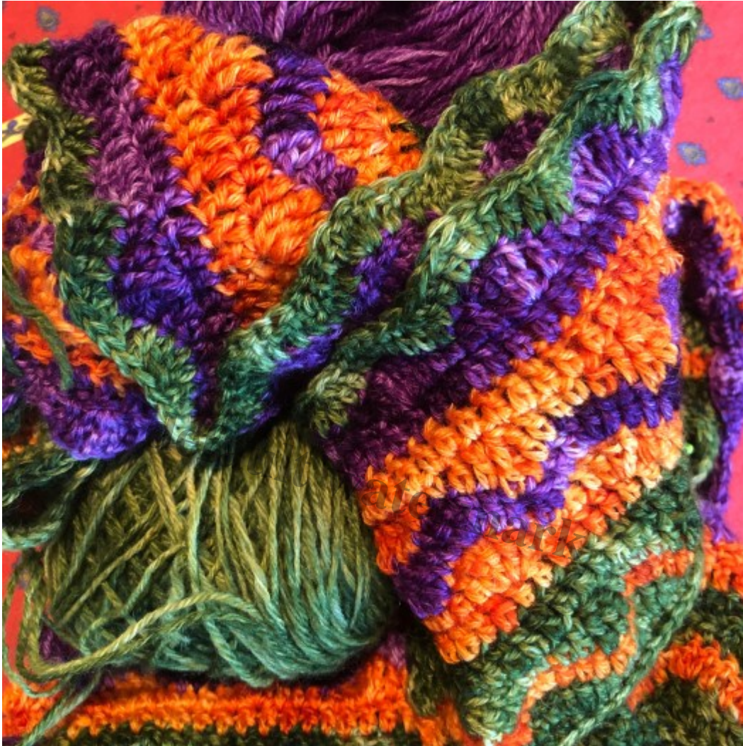
Rhapsodic Ripples Cowl 9/20