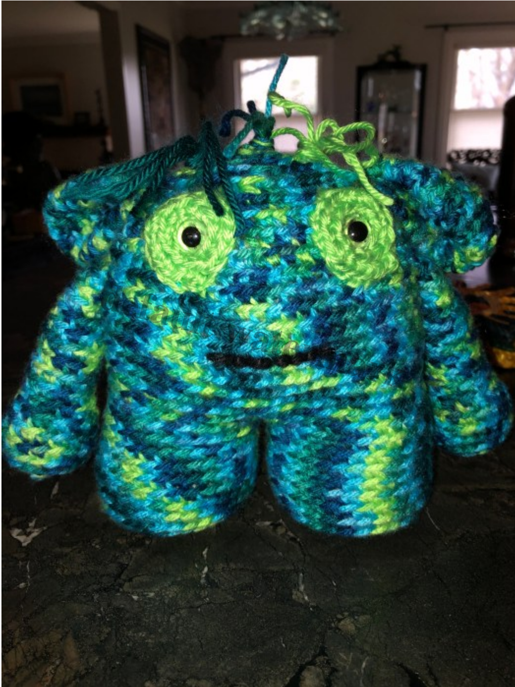
• Alien friend