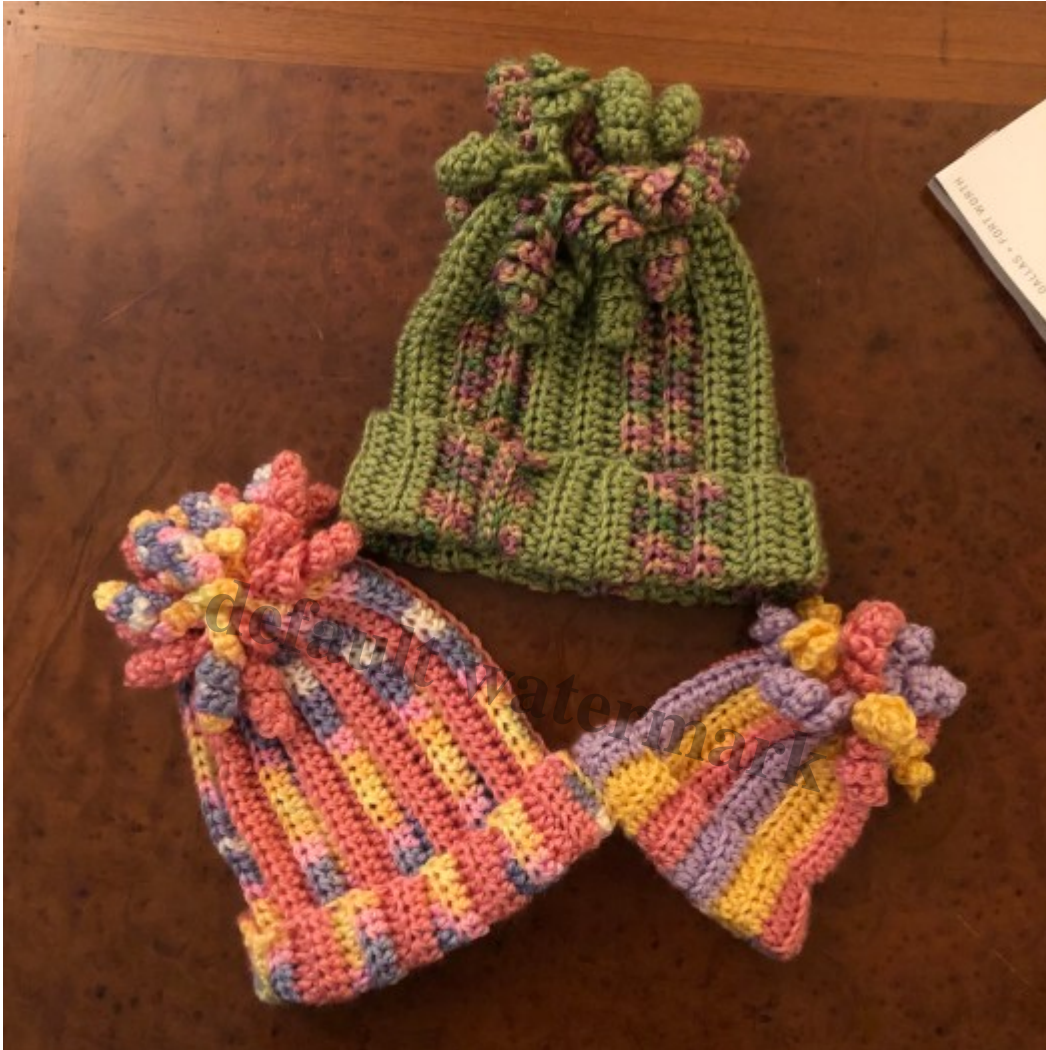
Delaney Hats 3/20