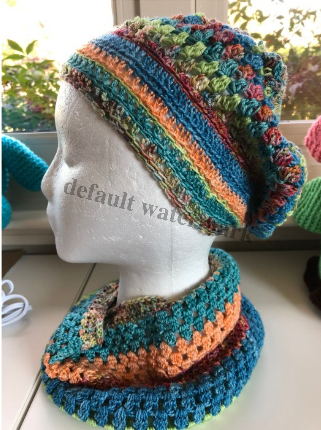
Mandala hat/cowl 2/20