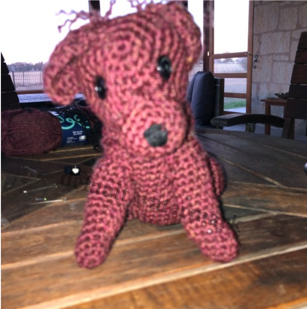
Lil Pup 10/20