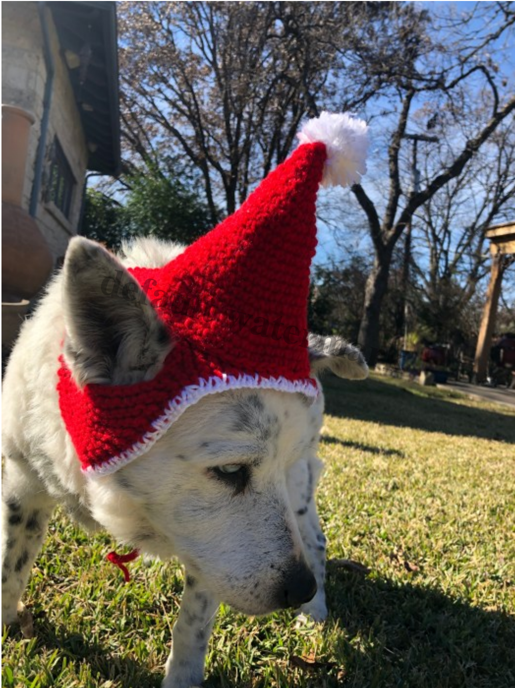
Santa Paws 12/20