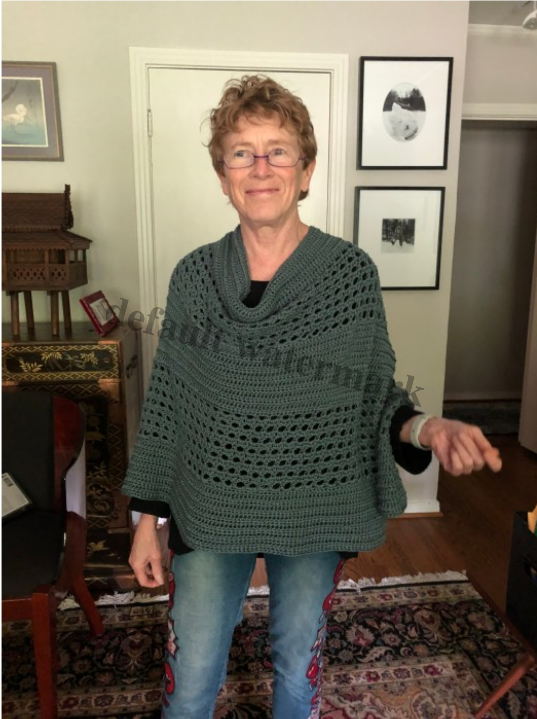
Summer Poncho 4/20