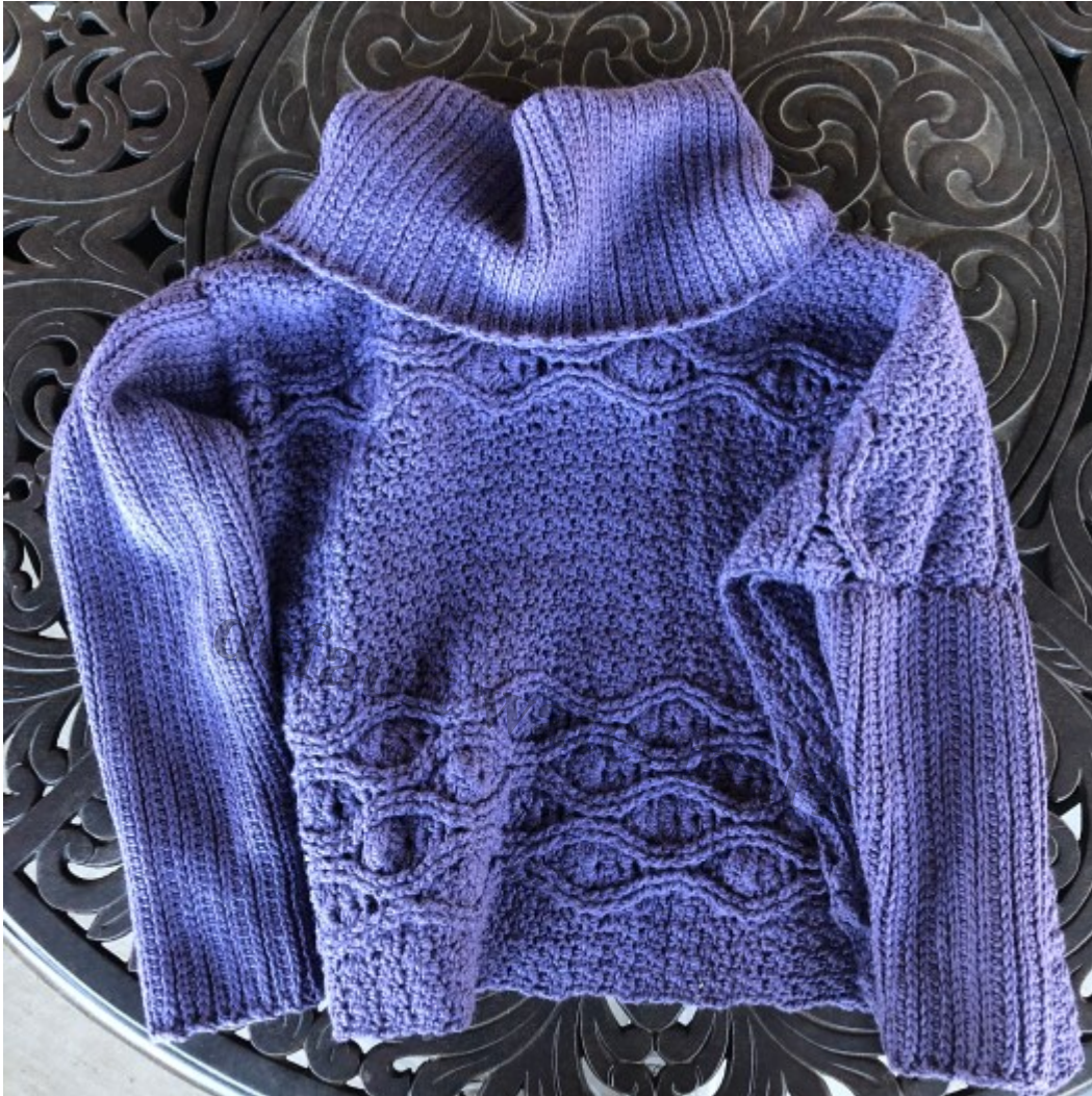
Fall Sweater 10/20