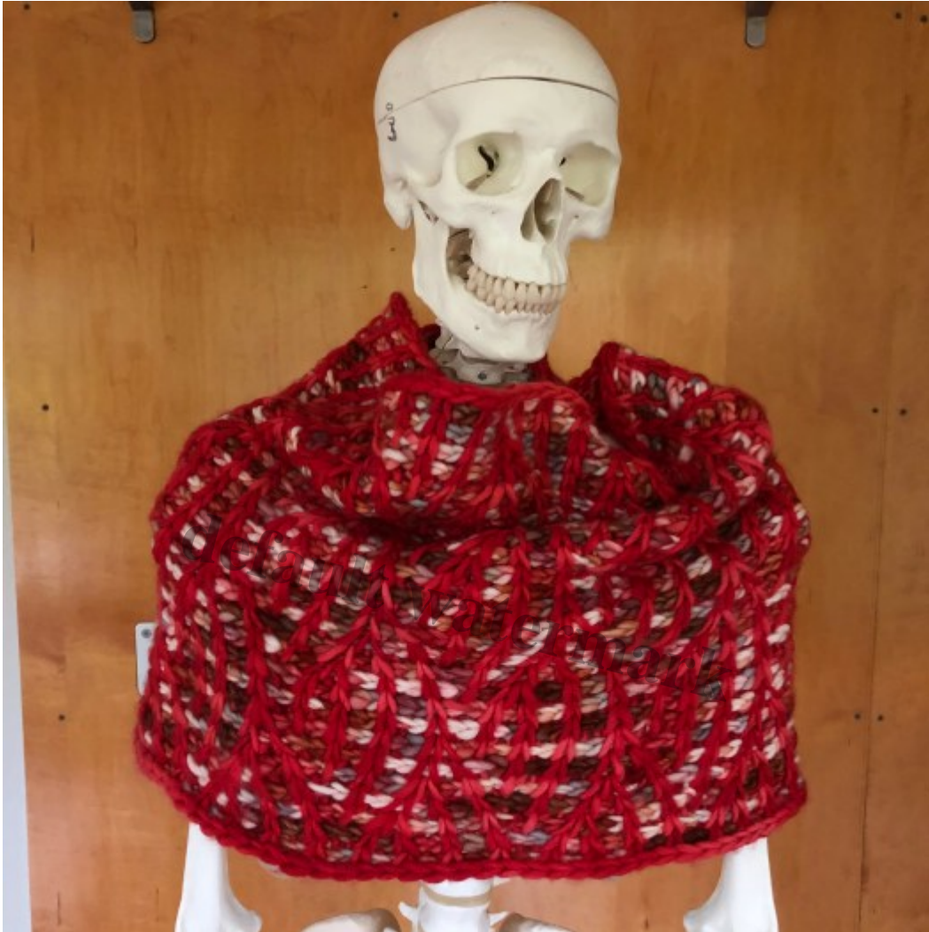
Fable cowl 3/20