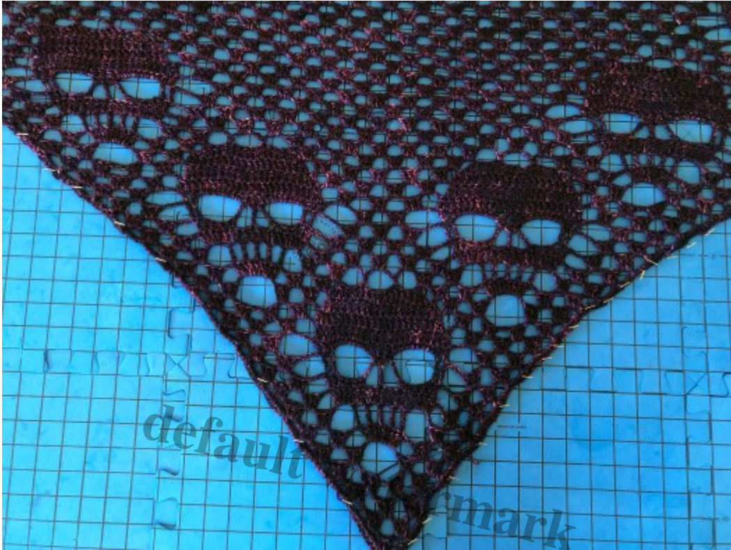
• Skull Shawl 9/20