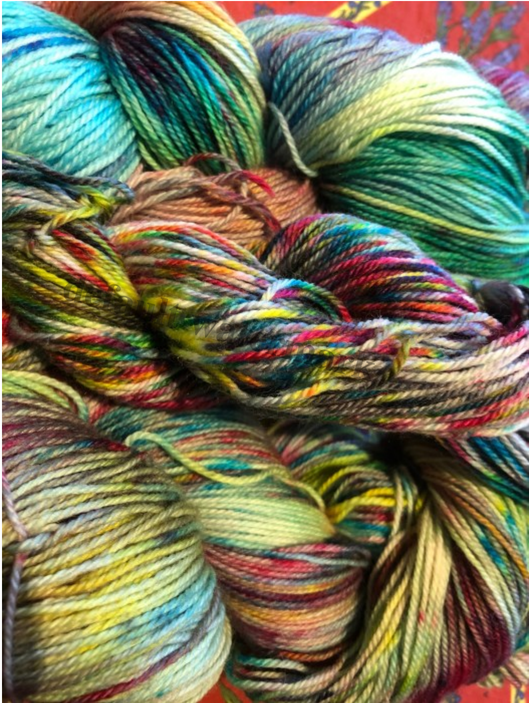
• Acid dyes on super wash