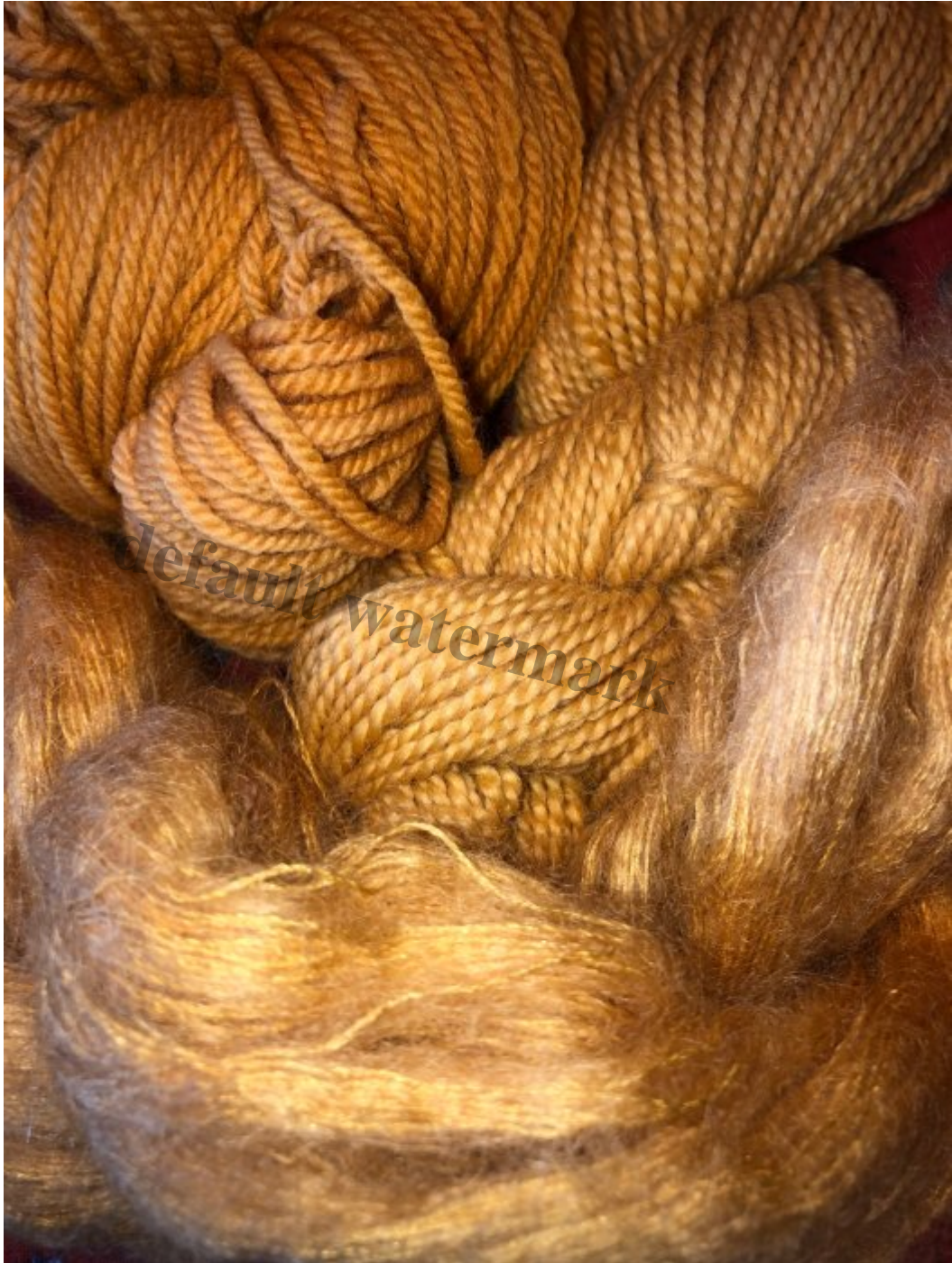
• natural dyes on various fibers

Ok, letâ??s make it even more complicated. Wouldnâ??t it be great to dye my yarn using plants from my garden. I have lots of green in the garden. And thatâ??s where I am now. I have made a lot of brown, using plants that I am told will make green. I do not have any photos of these attempts since, well, brown not green. I will get back to it sometime this Spring.