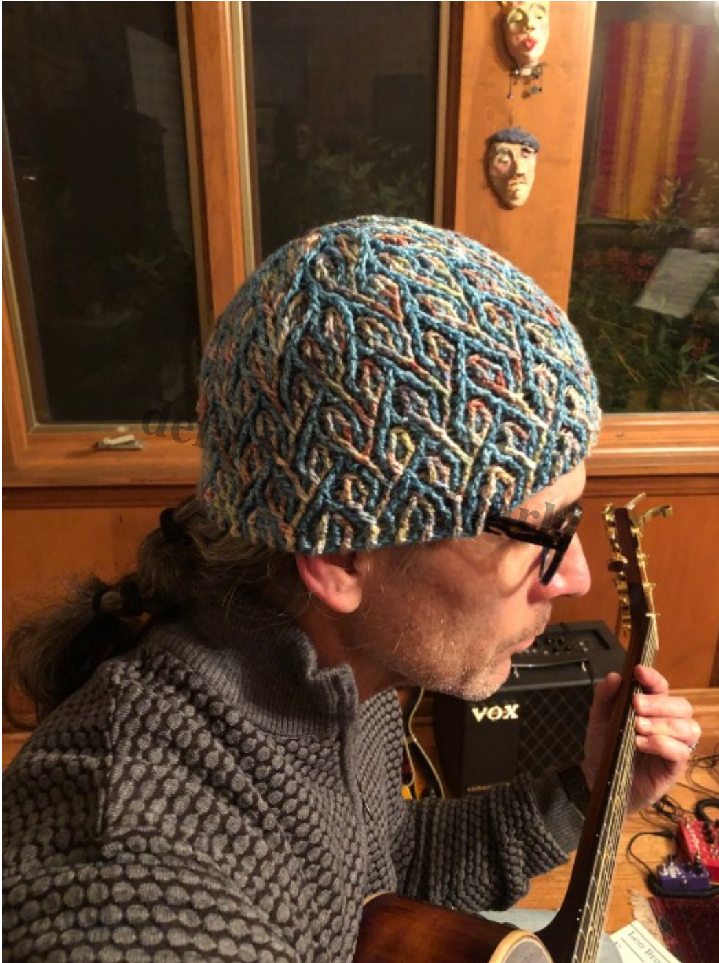
• Garde Grows 1/21