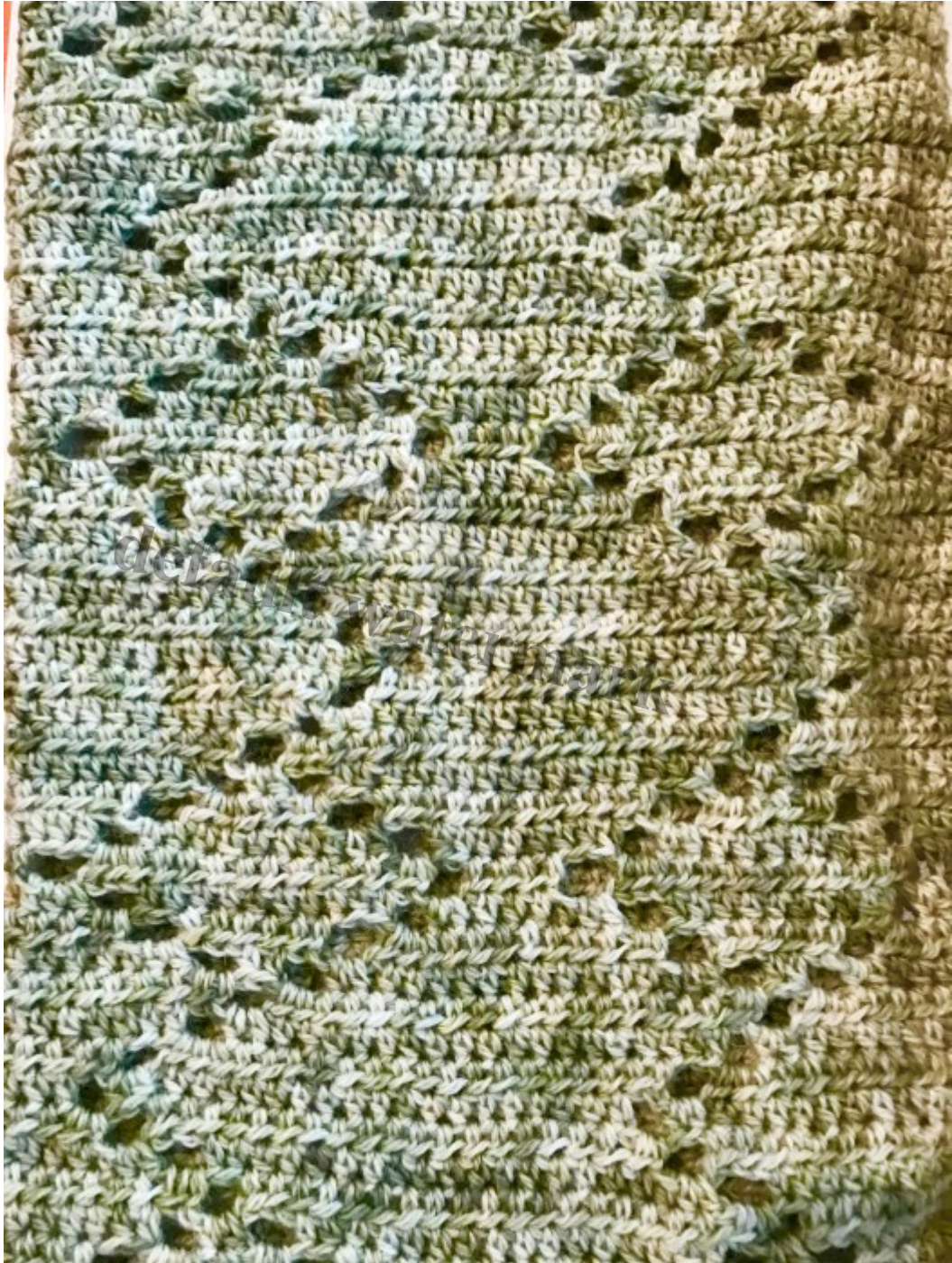
• Diamond Love Wrap

That of course is a completely different quest. First, find the yarn base. Check. Took me a while but I have it. Second, learn how to dye yarn. How difficult can it be to make green? I took some classes/watched some lectures and demos where both acid dyes and natural dyes were used. Below are the yarns I dyed. Pretty cool. Tom has promised to make me something with the yellows (spoiler); I have not decided what to do with the acid colors. However, does anyone see any green in the below photos that approaches the colors in the above photos?