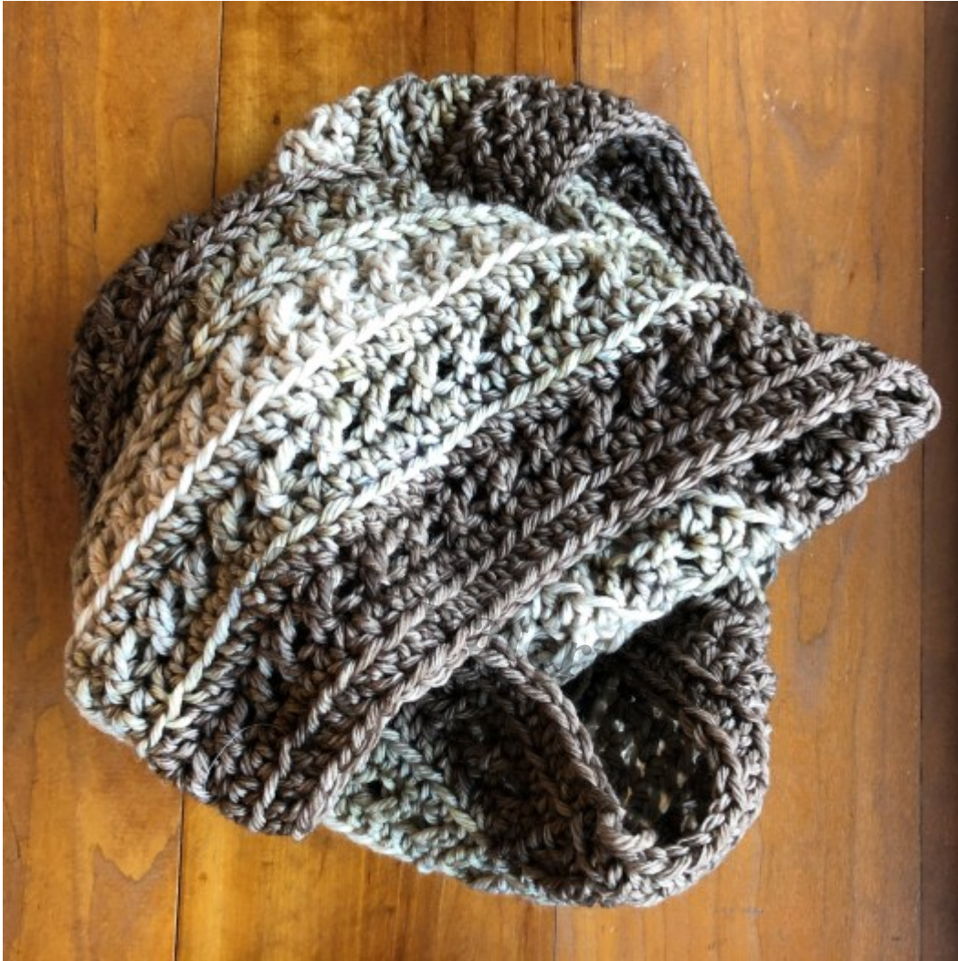
Guernsey Cowl 1/21